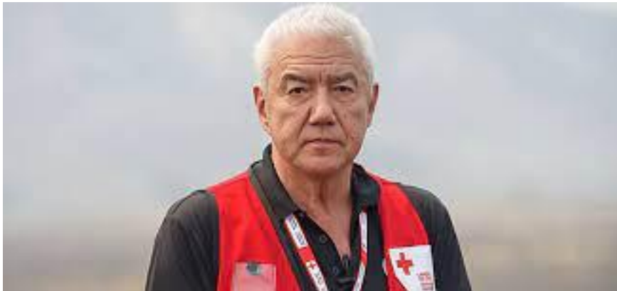
Thomas Dale Jackson - OPENING WITH SPECIAL MESSAGE AND SONG “Lost souls”

Thomas Dale Jackson, is a Canadian actor and singer. At 17, Jackson began playing coffeehouses and soon became one of Canada's top singers. He created and starred in an annual series of Christmas concerts called the Huron Carole for 18 years in order to support the Salvation Army. He was the Chancellor of Trent University from 2009 until 2013. He played Billy Twofeathers on Shining Time Station and Peter Kenidi on North of 60 .